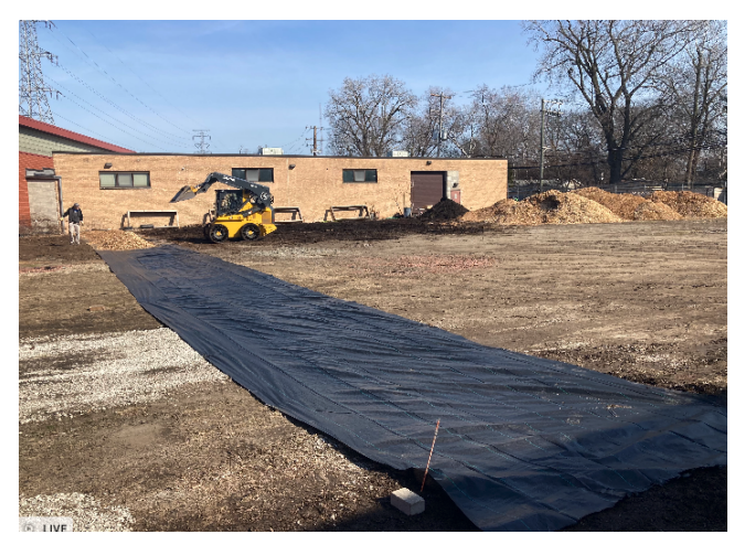
Above: Greenwise tractor, EG staff and volunteers help prepare the new half acre farm in west Evanston to grow thousands of pounds of produce for nearby distribution.